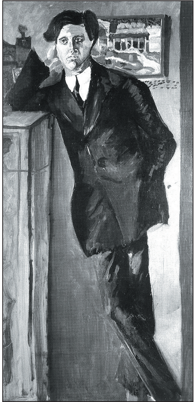
Portrait of Alban Berg by Arnold Schoenberg (undated)

Berg died on Christmas Eve, 1935, in Vienna, apparently from blood poisoning caused by an insect bite. He was 50 years old.