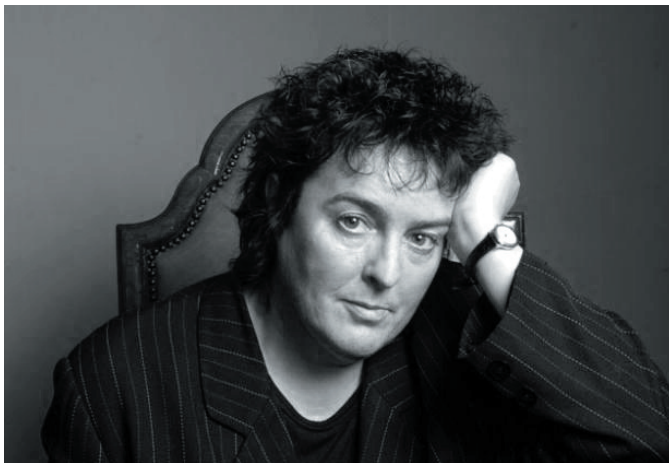
Carol Ann Duffy